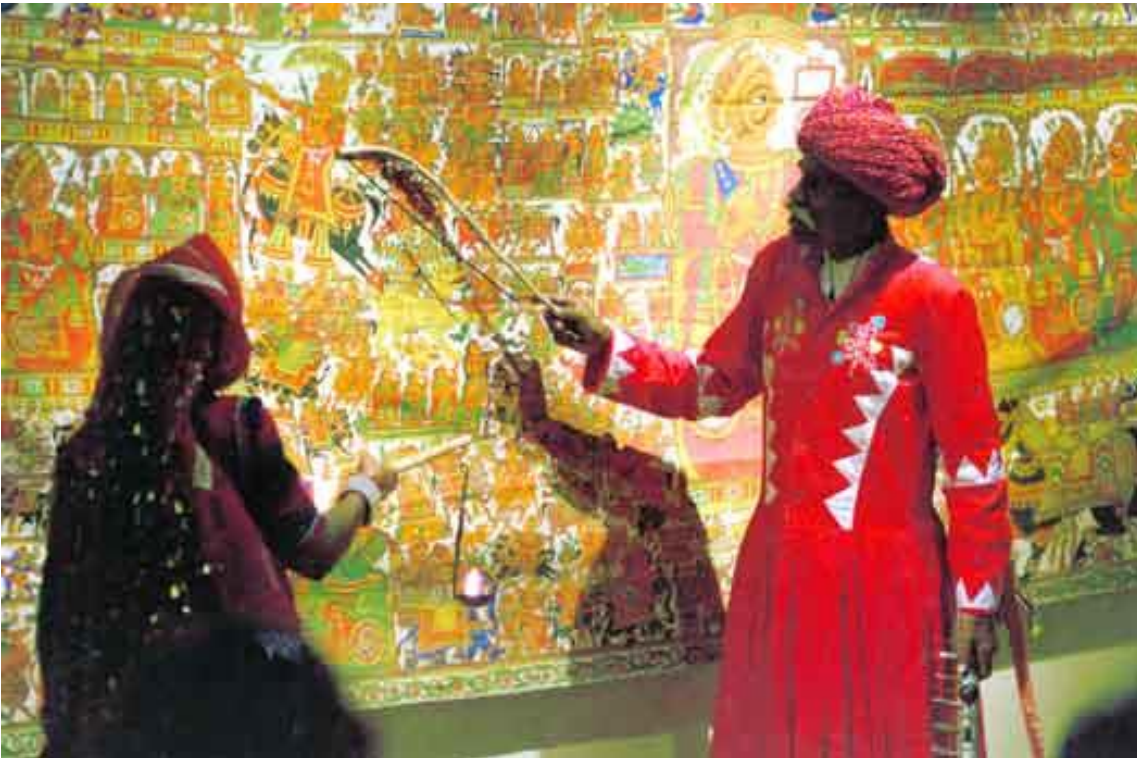
Phad at its natural setting