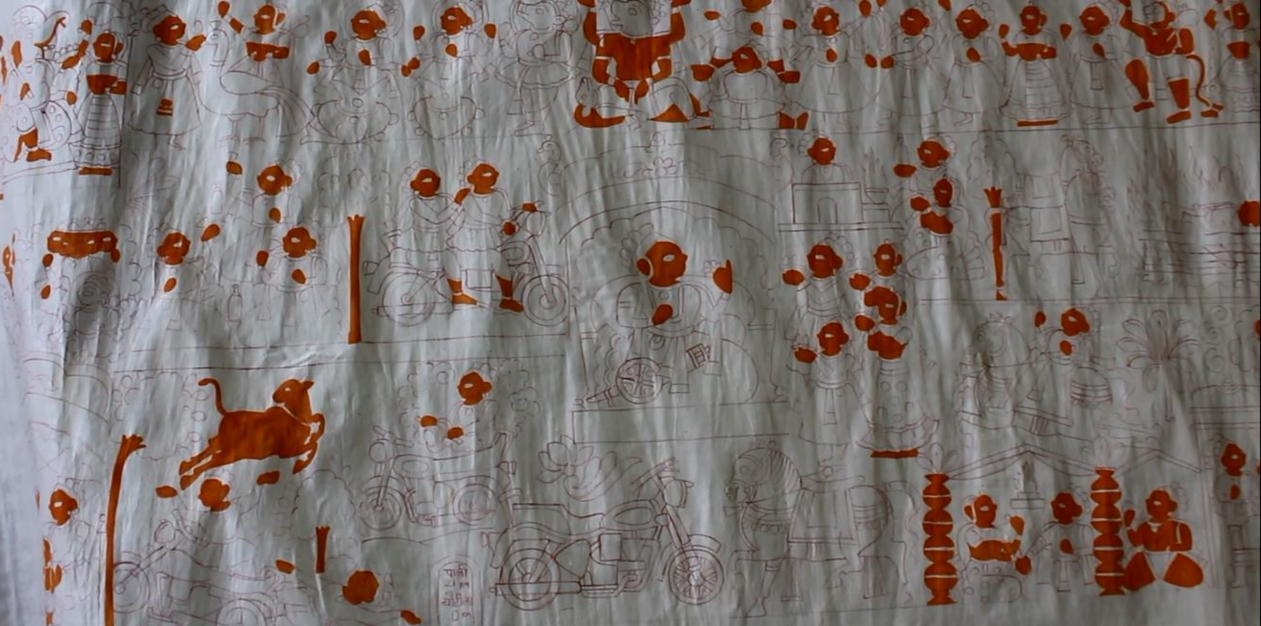
Entire Phad is Painted at Time