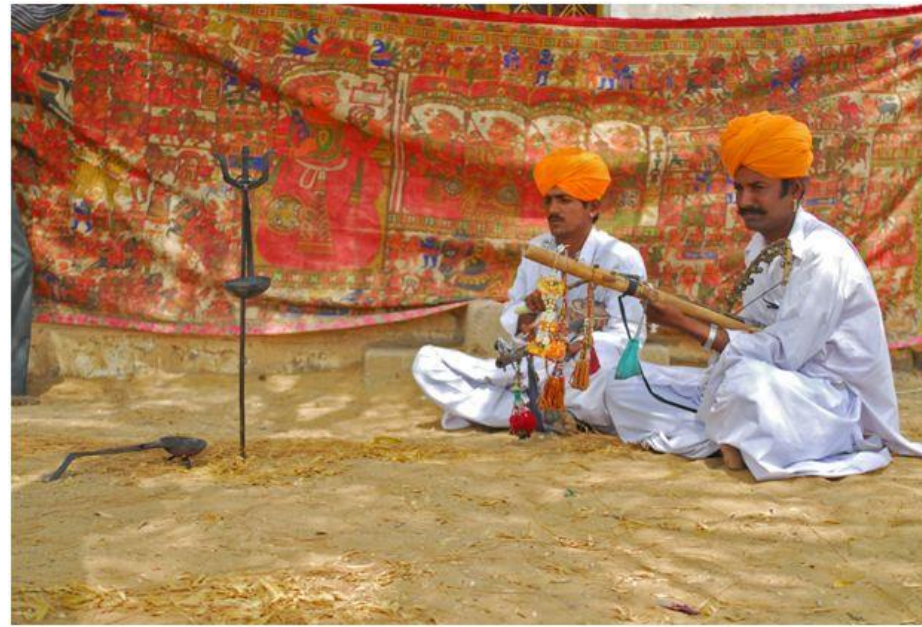
Reading of The Phad