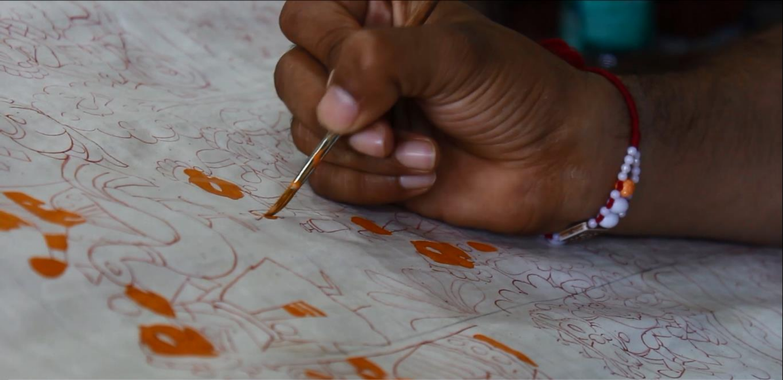
Addition of Colors