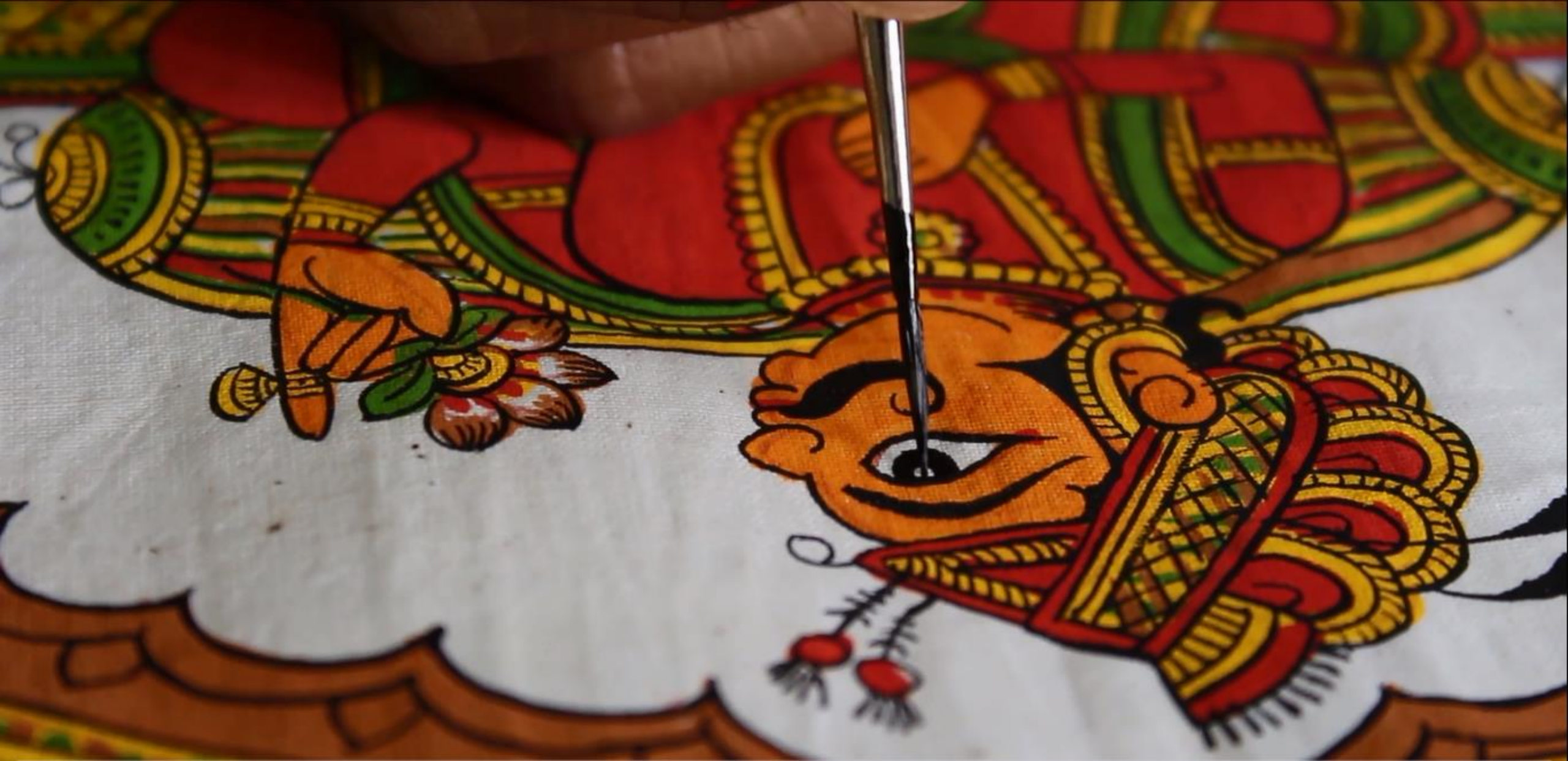
Consecrated Phad/ Active Phad