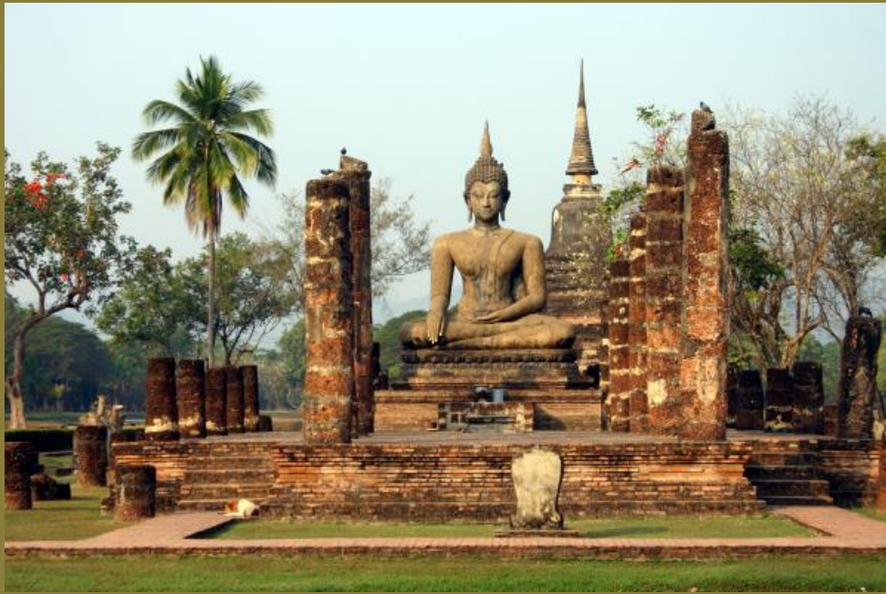
Sukhothai (1238 - 1438 AD)